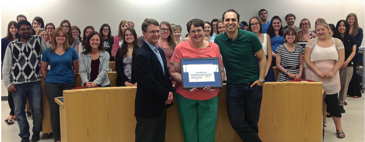
Presentation of the prestigious Alexander Fraser Award at the 2014 Conference.

A Special Thank You To These Previous AAO Sponsors!