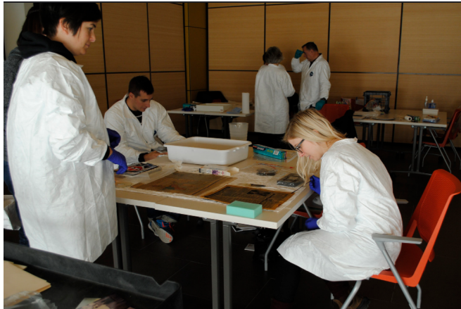
Emergency Response and Salvage Workshop, City of Ottawa Archives, 2015.

The AAO is dedicated to supporting archives and archivists in Ontario who are working tirelessly to improve and maintain these vital resources, from the earliest documents recording the history of our province, cities and towns, to cutting-edge processes in preserving digital information into the future.