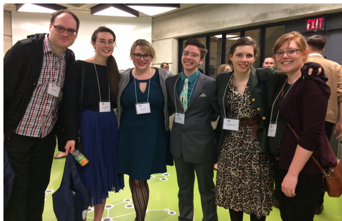
Above: University of Toronto iSchool Students at the 2017 AAO Conference in Toronto. On the cover: Opening plenary of the 2017 AAO Conference in Toronto.

Our five local chapters cover the majority of the province and organize community events and networking opportunities.