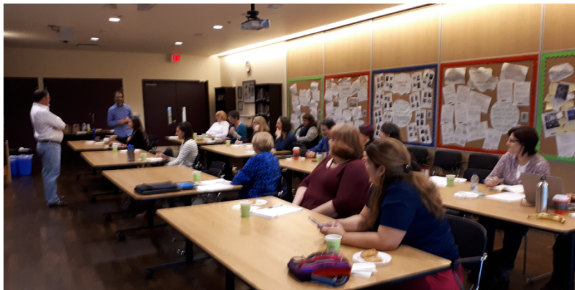
2017 Institutional Issues Forum at the Archives of Ontario, Toronto