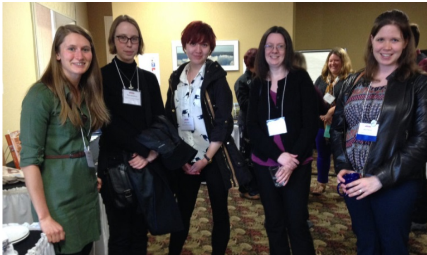
Young professionals network during a coffee break at the 2016 AAO Conference in Thunder Bay